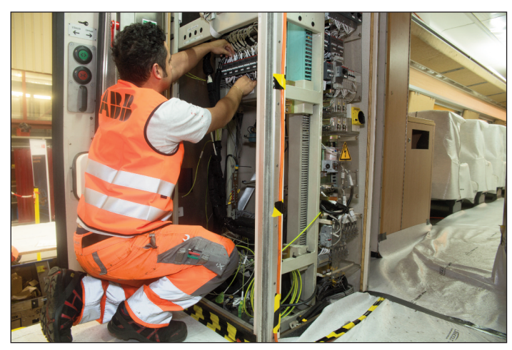
Installation of new systems in an old design configuration, and refurbishing some of the original components, is time-consuming work.

Dynamic testing is envisaged for the pilot train on the Swedish network during 2017 and the first guarter of 2018. Initially, authorisation is to be obtained for nocturnal testing on stretches of line which are not used then by other trains. Then permission is to be granted for daytime testing on lines which are in regular use by other trains. All these tests will be realised without passengers on board. Full authorisation is ex-