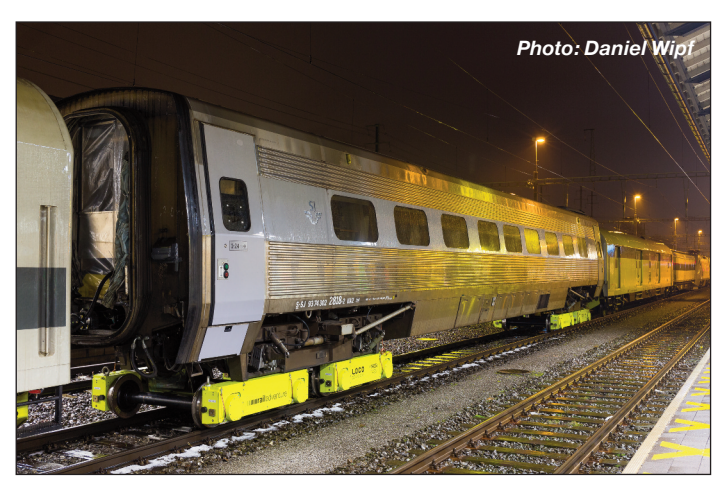
During the evening of 31 January 2017 the three upgraded cars from a pilot X2000 left Switzerland en route for Sweden. These photos were taken at Pfäffikon SZ. While the two end cars could run on their own bogies, it was necessary to mount the intermediate car on RailAdventure's loco buggies for the run through Switzerland (see right-hand photo), on account of difficulties in obtaining permission for it to run on its own bogies, and to avoid the problems which occurred with this intermediate car during its movement to Switzerland (see R 2/15, pp. 26 - 27). For the run to the German border haulage was provided by a SBB's locomotive Re 4/4 II 11256. At Basel the train was handed over to RailAdventure, which provided haulage using its 139 558 electric to Rostock.