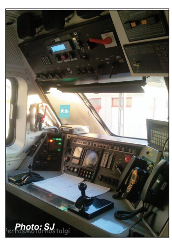
As part of the interior refurbishment new driving consoles are installed in the power car and driving trailer. The edge of the driving console is now curved, thus being more ergonomic (compare with the photo on the right, showing the original console). The new consoles are also prepared for the future installation of on-board ETCS displays. To comply with safety requirements the driver's seat is designed to be pushed back so that the occupant can leave it quickly in an emergency.

nally SJ had 43 X2 trains in service, with a variable number of between four and seven non-powered cars in the formations). Both contracts are to be realised in the Tillberga works, which is run by the State-owned rail real estate manager Jernhusen, responsible for stations and other buildings, using different parts of the works complex and involving two independent suppliers.